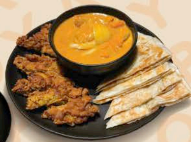
MASSAMAN CURRY WITH FRIED CHICKEN WITH ROTI 29.9 มัสมั่นไก่ทอดและโรตีสาน