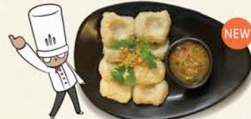
FRIED THAI FISH BALLS WITH THAI SPICY SAUCE (8PCS) 9.9 ลูกชิ้นปลาทอด