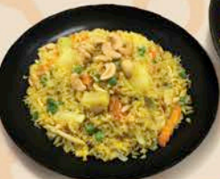
PINEAPPLE FRIED RICE WITH CHICKEN 21.9 ข้าวผัดสับปะรดไก่