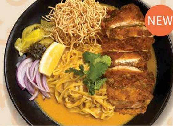
KHAO SOI WITH FRIED CHICKEN 23.9 ข้าวซอยไก่ทอด