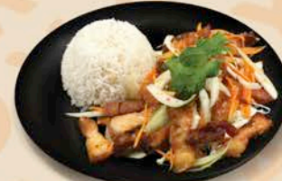
THAI CRISPY PORK SALAD 22.9 ยำหมูกรอบ