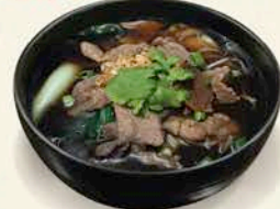
BEEF NOODLE SOUP 23.9 ก๋วยเตี๋ยวเนื้อ