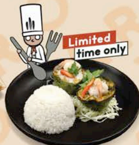
HOR MOK TALAY 21.9 หมกหมกทะเล