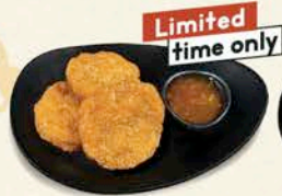
SHRIMP CAKES (3PCS) 13.9 ทอดมันกุ้ง