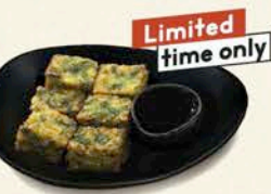
CHIVE NUGGETS (6PCS) 10.9 กล้วยข้าวทอด