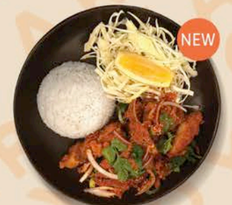
LAAB FRIED CHICKEN 22.9 ลาบไก่ทอด