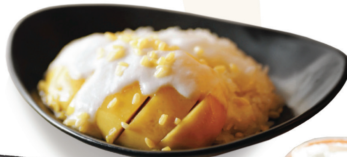
THAI MANGO STICKY RICE

THAI MANGO STICKY RICE V GFN ข้าวเหนียวมะม่วง 12.9 Thai mango slices (defrosted), sticky rice, coconut milk, mung bean chips