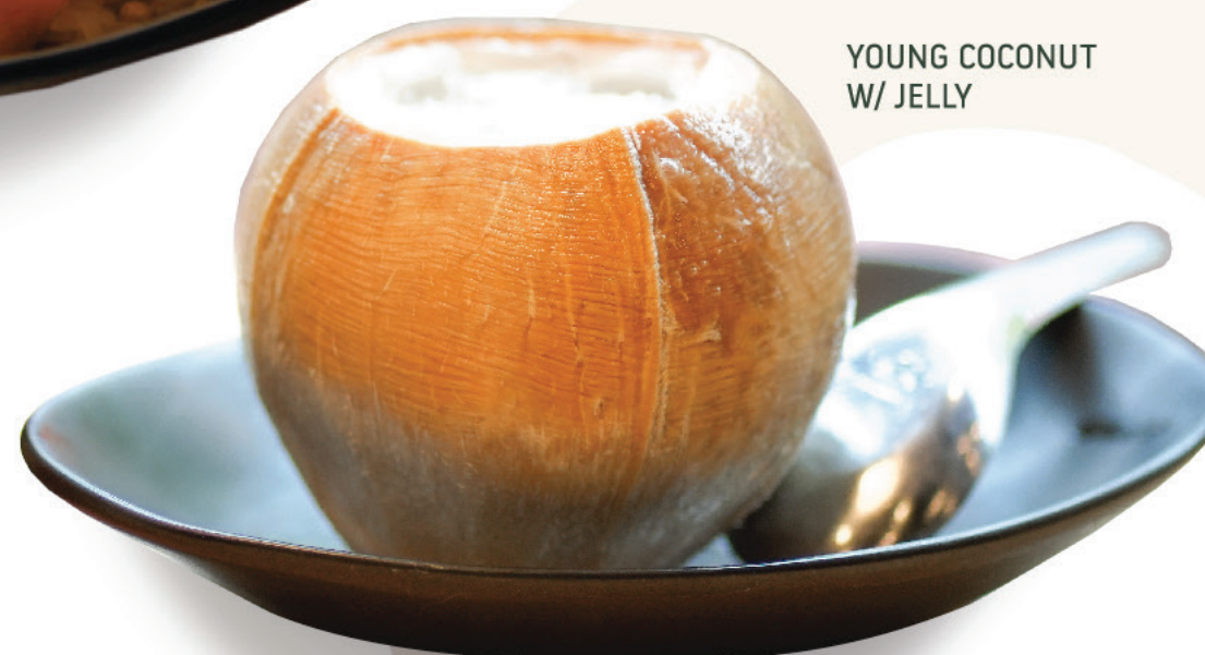
YOUNG COCONUT W/ JELLY