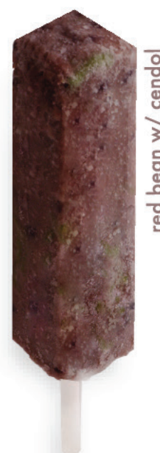
red bean w/ cendol

red bean w/ cendol ลอดช่องถั่วแดง 3.5 C milk tea ชานม 3.5 black bean w/ sticky rice ข้าวเหนียวถั่วดำ 3.5 C durian w/ sticky rice ข้าวเหนียวทุเรียน 3.5 taro เผือก 3.5 C coconut มะพร้าว 3.5