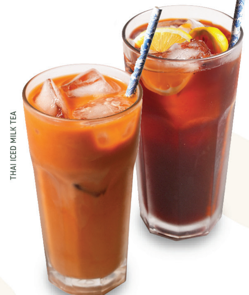
THAI ICED MILK TEA