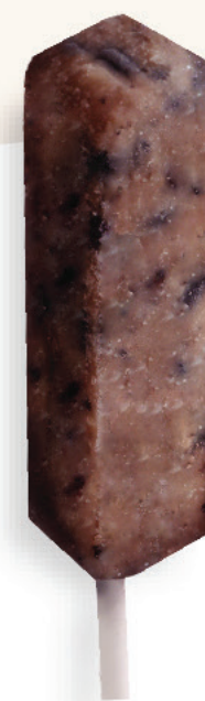
black bean w/ sticky rice